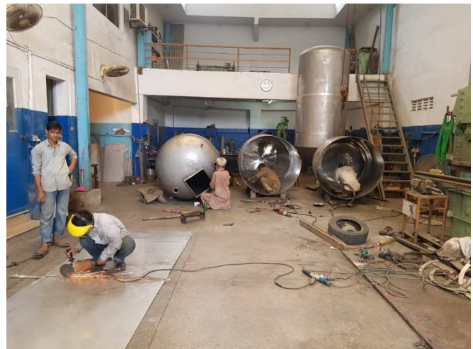
Tanks and Vessels Storage tanks processing tanks and Cooking tanks Jecketed.