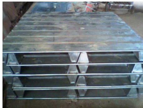
Pallets in Angel Iron or GI Sheet complete