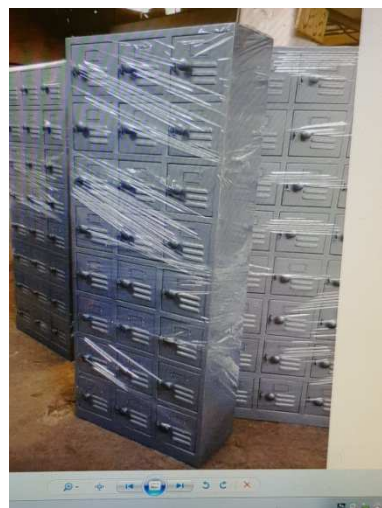
Cabnets, Lockers, Change room tables stools, Shoe racks, Sinks, wash basins. SS or MS