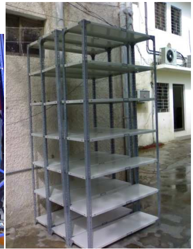
Store Racking System Cantilever, Heavy duty, Drum Racking, four angle racking.