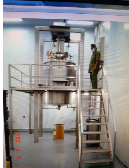
Platforms for Tanks vessels and MS flooring