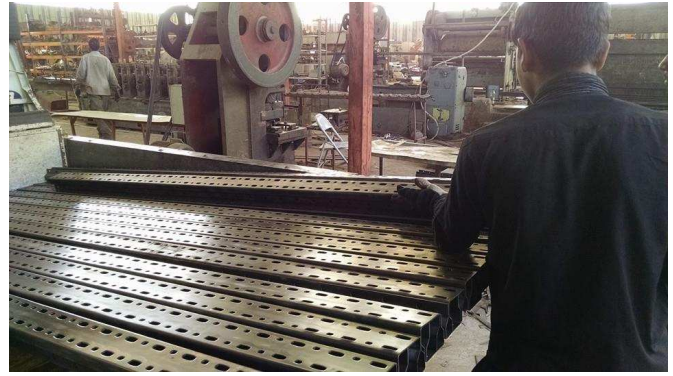
Mass manufacturing in MS Racking, Pallets and Platforms