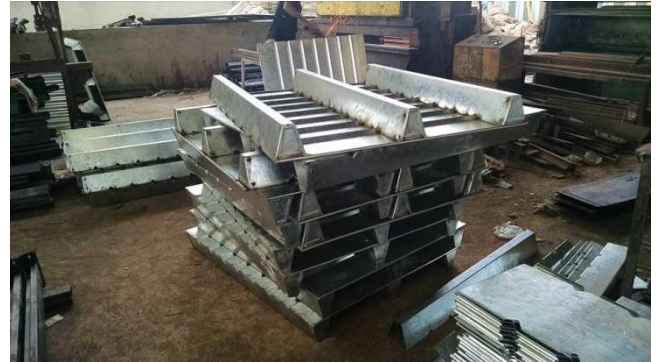
Fixing & Installation